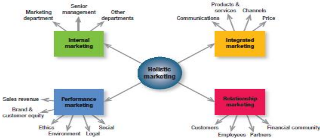
Figure 1. Elements of holistic marketing approach