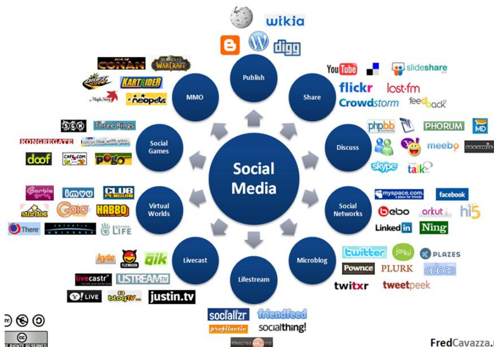
Figure 2. Landscape of social media

In this new digital environment, it is important that professors accept technology, as modern approach to education. Also, it is important that professors improve their pedagogical skills, in the way to open mind and heart, and understand young generations. There are so many ways to teach students, to inspire them and to motivate them. Modern environment requires modern pedagogic and professors. Many schools and faculties have information platform for educational process. In that way, students can read materials after school, but also can ask professors about educational topics. Experience of professors in focus group tell us that students want to have materials online, but also, want communications with professors. The landscape of social media is present in Figure 2.